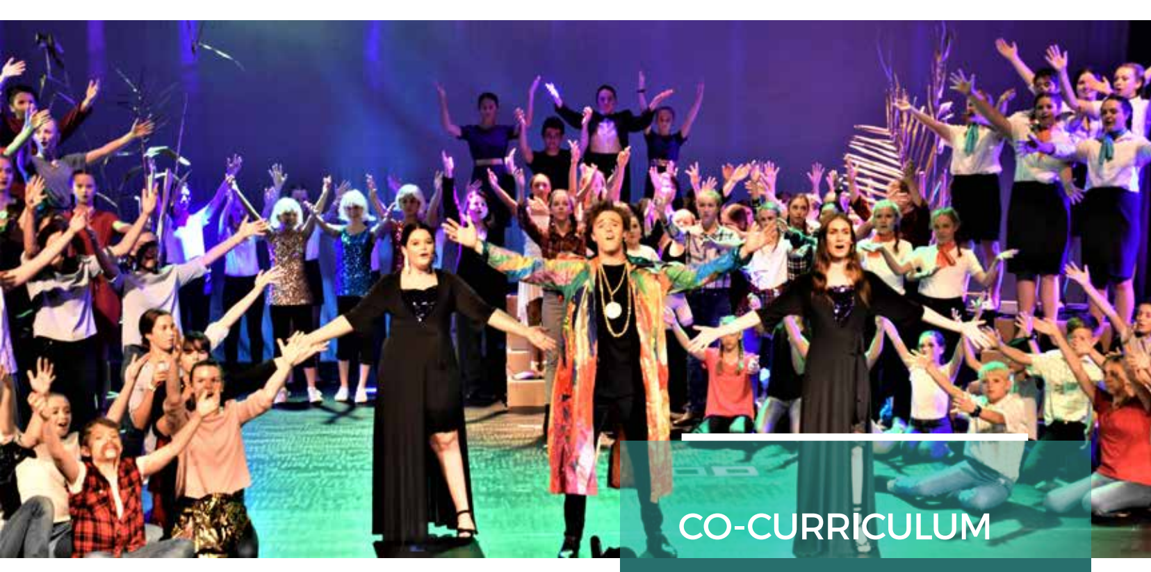
CREATIVE & PERFORMING ARTS