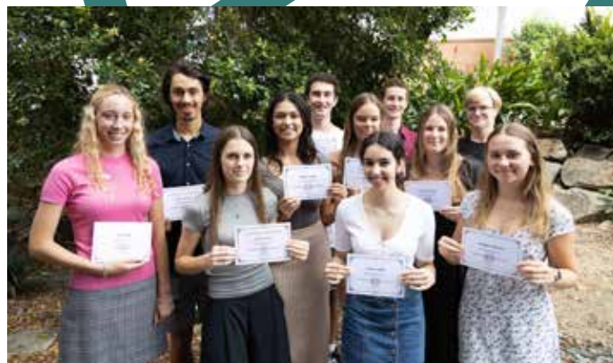
2022 Graduates received their certificates at the 2023 College assembly.

In addition, the College recognised nine ATAR-eligible students