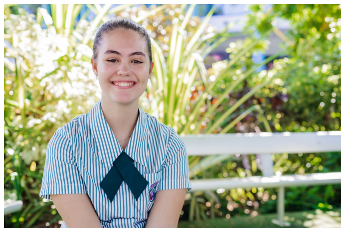
middle school students