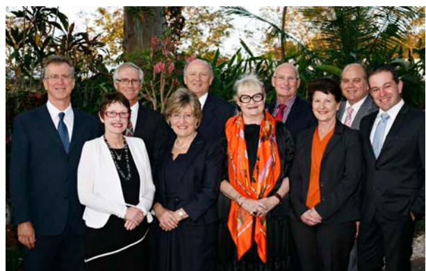
NCC Board Members

Nambour Christian College is an independent multi-denominational Christian school and is a member of I.S.Q. (Independent Schools Queensland), A.C.S. (Associated Christian Schools) and A.H.I.S.A. (Association of Heads of Independent Schools Australia).